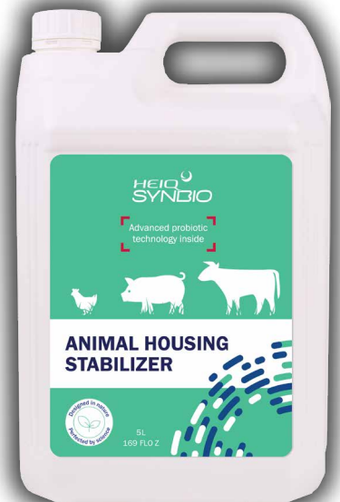
Animal Housing Stabilizer