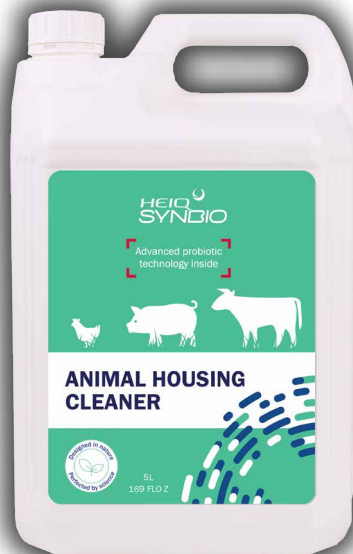
Animal Housing Cleaner